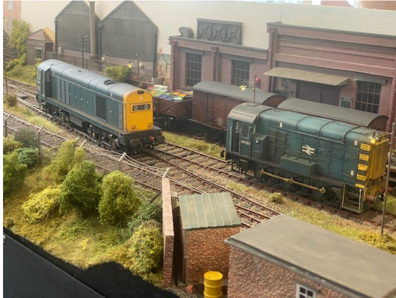
A bit of 1980s England.

A scene from one of the 0 Gauge layouts at the Macclesfield Model Railway Exhibition in March this year.